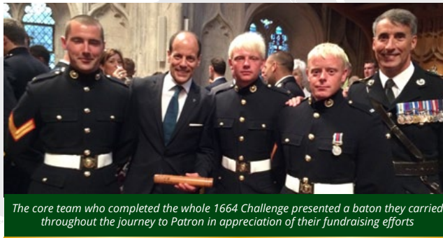
The core team who completed the whole 1664 Challenge presented a baton they carried throughout the journey to Patron in appreciation of their fundraising efforts