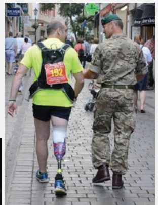
Walking with injured Marines every step of the way

The Royal Marines are world famous as the UK's elite amphibious force but over the last 12 years, the Corps has suffered deaths and injuries disproportionate to its size in the British Armed Forces.