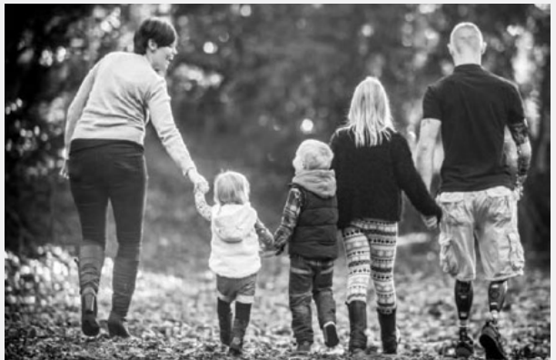
Helping the Royal Marines get back on their feet