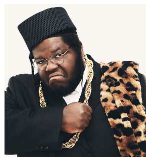
Nissim Black Rap Icon