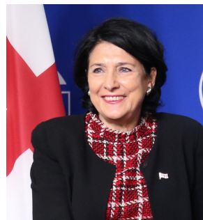
Her Excellency Salome Zourabichvili President of Georgia