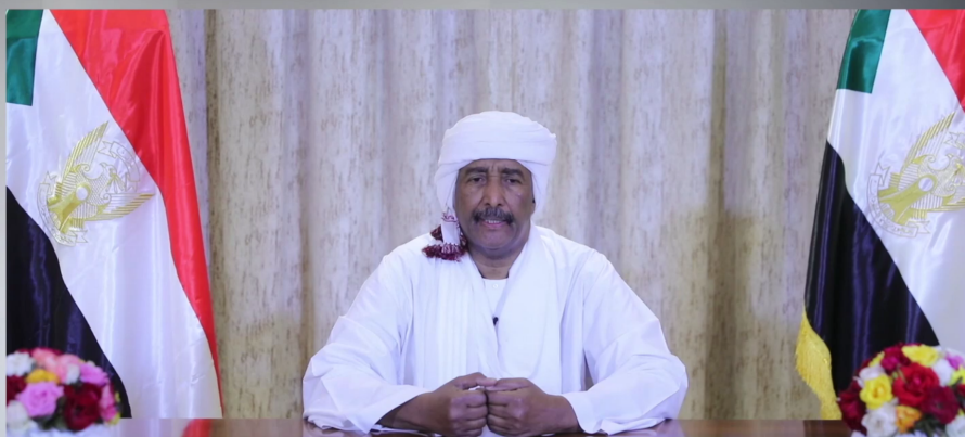
His Excellency Abdel Fattah al-Burhan Chairman of the Sudanese Transitional Sovereign Council

of promoting peace-making and prosperity in our planet.