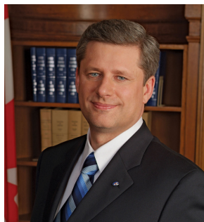
Stephen Harper Former Prime Minister, Canada