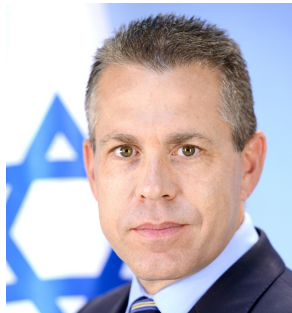
Gilad Erdan Israel's 18th Permanent Representative to the UN and Ambassador to the US