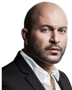
Lior Raz Creator & Star, Critically-Acclaimed TV Series "Fauda"