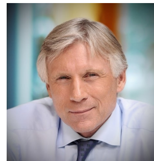
Lee C. Bollinger President, Columbia University