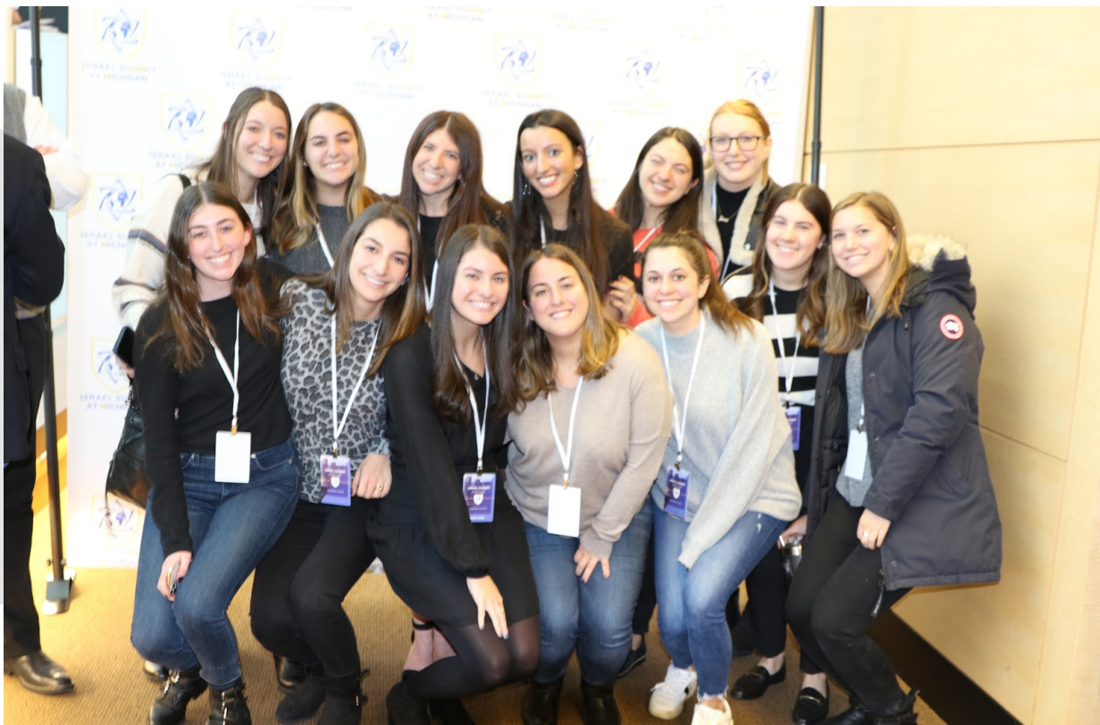
2019 ISRAEL SUMMIT AT THE UNIVERSITY OF MICHIGAN

The Israel Summit 2021 brought students together virtually on a groundbreaking magnitude. Our goal was to provide an immersive and holistic opportunity to connect with Israel and to use this virtual setting as a springboard to see in-person Summits on campuses all across the globe when we are able.