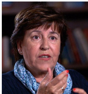
Ankie Spitzer Journalist, Widow of Israeli Olympic Athlete, Munich 1972