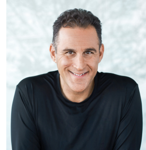
Barak Regev CEO, Google Israel