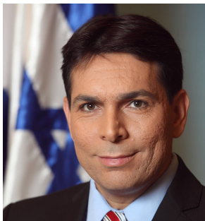
Danny Danon Israel's 17th Permanent Representative to the UN