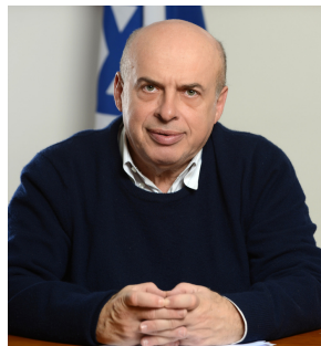
Natan Sharansky Human Rights Activist