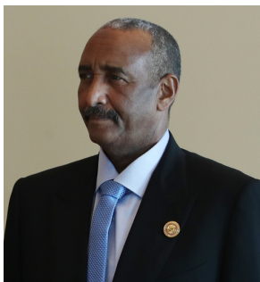
His Excellency Abdel Fattah Al-Burhan Chairman of the Transitional Sovereign Council of Sudan