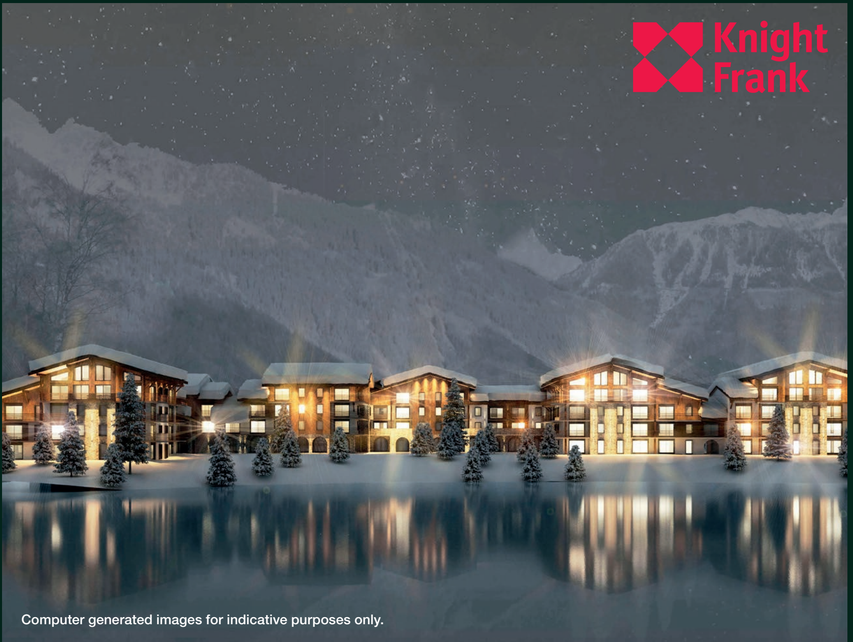
Computer generated images for indicative purposes only.