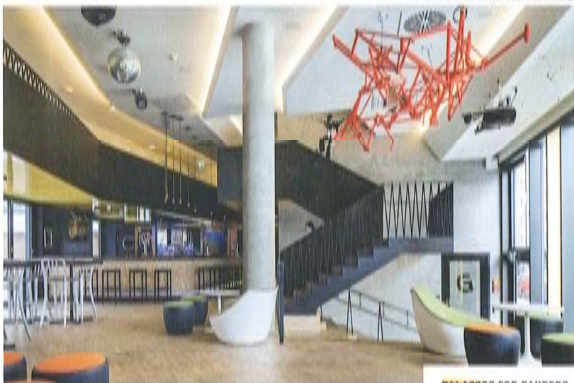
The bar at Generator Hamburg