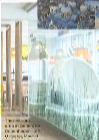
The chill-out area at Generator Copenhagen. Left: U Hostel, Madrid