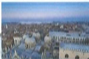
Right: The Venetian skyline. Left: A room at U Hostel, Madrid